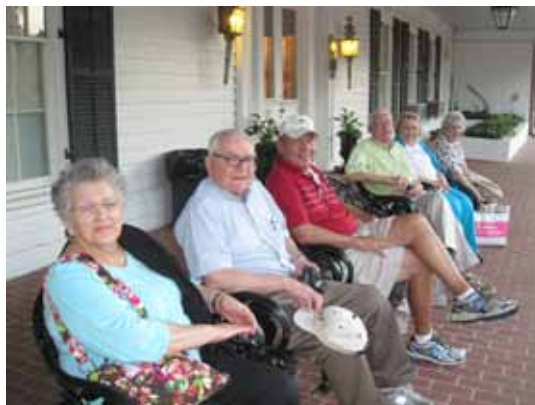
Relaxing in front of Excelsior House