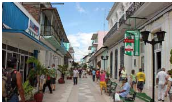
Sancti Spiritus, Cuba

The missionaries will return on November 1.