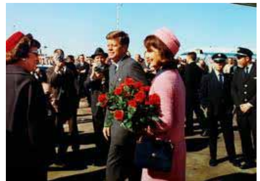
President Kennedy and his wife arrive in Dallas. November 22, 1963

On Wednesday, November 20, Saint Michael and All Angels will present, "A Theological Reflection on the JFK Assassination and the Following Years," a symposium looking at events leading up to the shooting of the President, people's reaction and horror, and what changes it has precipitated in our society. It will be held beginning at 6:30 p.m. in the Saint Michael Chapel, followed by a short reception.