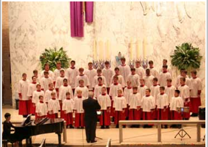
The Texas Boys Choir performed to a full house at Saint Michael Presents March 30 program.