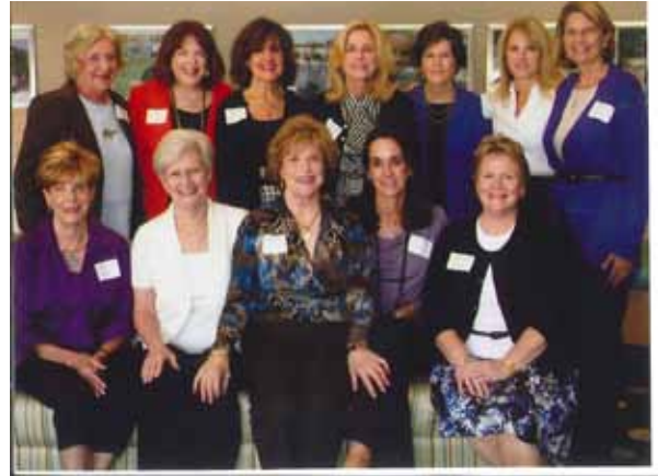
Our Current Regional Good Shepherds

In 1986, the Good Shepherd Ministry was commissioned. In the ensuing 27 years Good Shepherds have responded to the needs of fellow parishioners, celebrating their victories and accomplishments, and comforting and caring during times of struggle. Many of the Good Shepherd's activities have