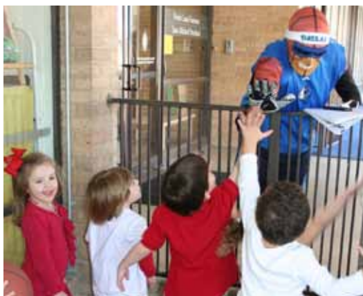
Mavs Man Visits Saint Michael Preschool