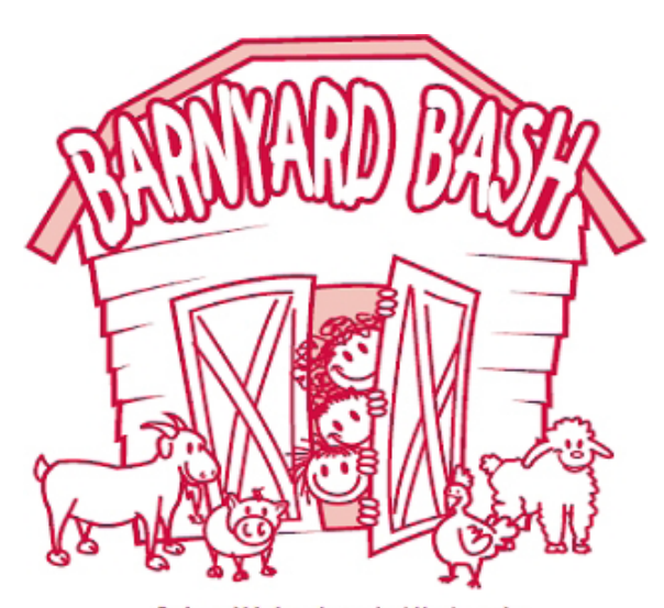
Saint Michael and All Angels Early ChildhoodMinistry

Ticket prices: Adults $10; children 1-12 are $5. Payments received after April 24 will be subject to an additional charge of $5 per ticket.